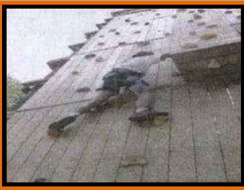
Winter camping and ice fishing are winter possibilities.

Waterville Area Boys & Girls Club and YMCA at the Alford Youth Center